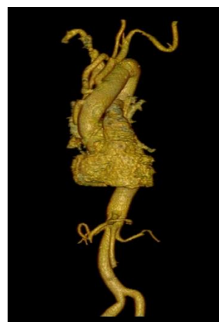
Figure 3. CT-scan showed no residual dissection of the ascending aorta