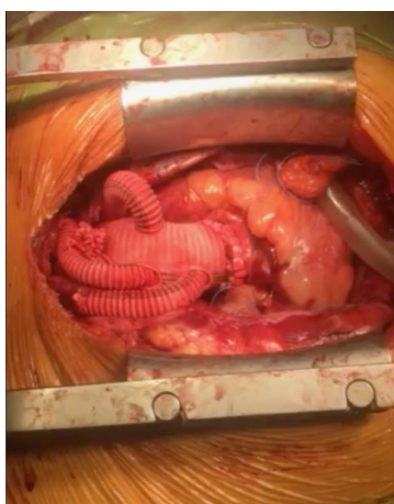
Figure 2. Intraoperative view of total aortic arch replacement with 4-branch gelatin-impregnated Dacron prosthesis